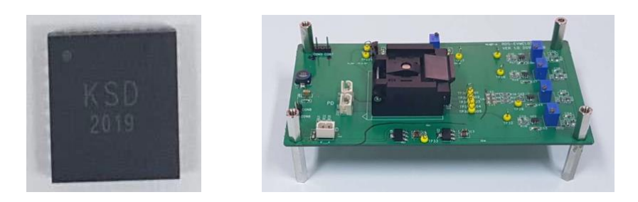
Figure 2. 2nd generation PCIC (QFN – 32 pins 5mm x 5mm) and its test board

Our state-of-the-art ASIC is capable of sampling and processing a much smaller signal from the photodiode at least 1,000 times faster (in a given time frame) than the existing